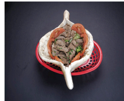
Beef Shawarma Sandwich