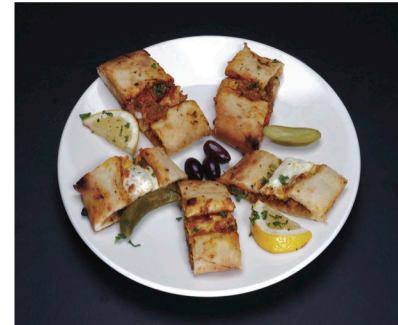
Beef & Lamb Pide with Eggs