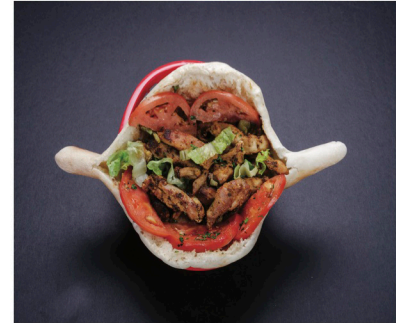
Chicken Shawarma Sandwich