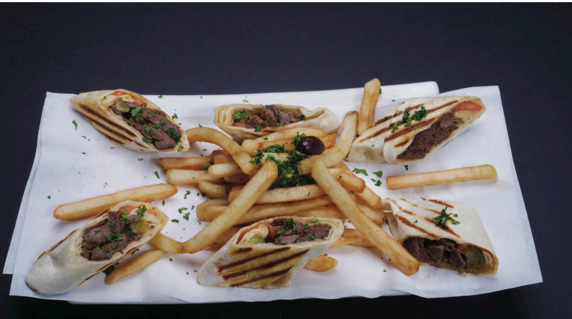
Beef Shawarma Saj with Fries