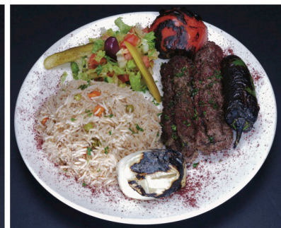
Beef & Lamb Kebab