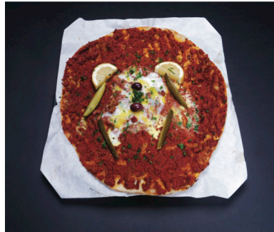
Lahmacun with Eggs