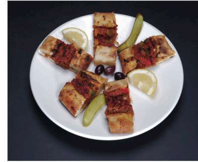
Beef & Lamb Pide