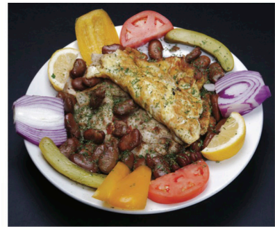
Fava Beans with Eggs