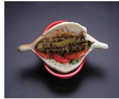
Chicken Kebab Sandwich