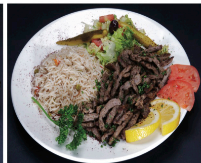
Beef & Lamb Shawarma